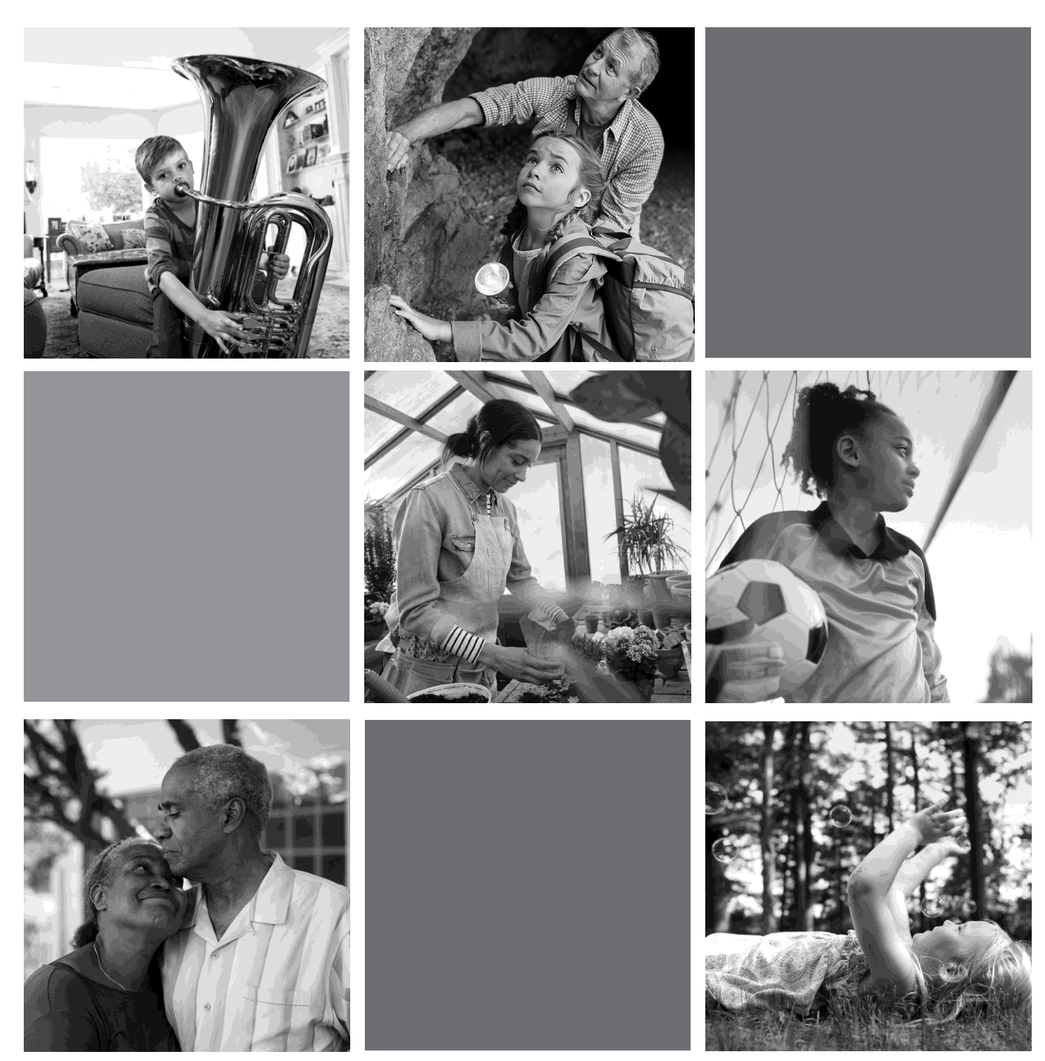
Your Dental Care Benefits Program Dental Benefits Current Dental Terminology® American Dental Association

Genesis Energy, LLC Account #086304 Group #327262